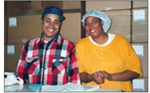
Workers enjoying time at Project Inc. in one of the early scenes from one of the first shops to open in the state.

County and state funding does fill a critical gap from higher overhead for workshop supervision and other services