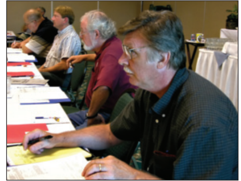
Workshop managers have worked and sometimes struggled to maintain quality services for people with disabilities. Staying abreast of changing regulations, technology and markets is a key.