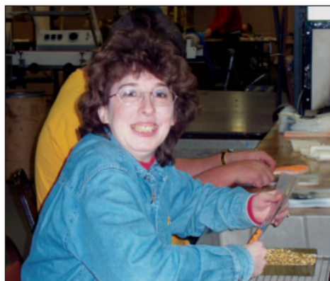
Workshops provide a wide range of services, but none is more important than services to people with disabilities. By providing a wide range of employment options, workshops serve communities across the state. And by doing this with a majority of funds derived business contracts, workshops ensure these options are delivered in a sustainable way.