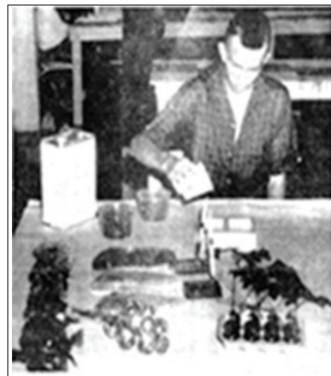
This early photo captured a worker in Missouri's first "official" workshop, Cooperative Workshop in Sedalia.

• 1977-1987, Doco, Web-County Custom Industries, Worth Industries, Tanton Industries, Three Rivers Industries, River Bluff Industries, Enterprises United, Jeff-County Subcontracting, Ideal Industries, Pemiscot Progressive Industries, Helping Hand, Cass County Area Workshop, ITE, Lake Area Industries, Big Springs, Canterbury Enterprises, Christian County Enterprises, Nocomo Industries, Oregon